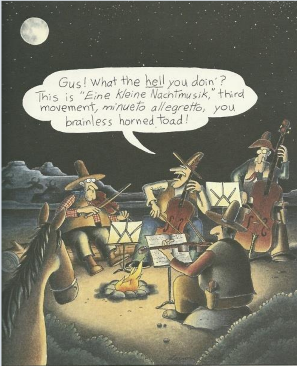
Cattle drive quartets